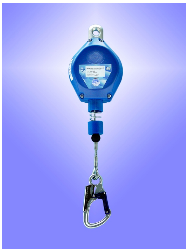
Art.-No.: 41-HWPS 4,5